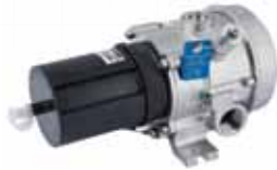
PointWatch Eclipse® IR Combustible Gas Detector