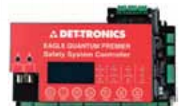
Eagle Quantum Premier® Safety System