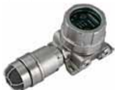
FlexSonic™ Acoustic Leak Detector