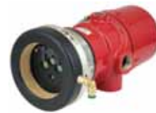
Universal Air Shield Assembly