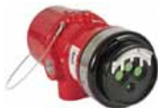
X3301 Multispectrum IR Flame Detector