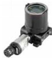
FlexVu® Universal Display with GT3000 Toxic Gas Detector