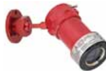
xWatch Explosion-Proof Surveillance Camera